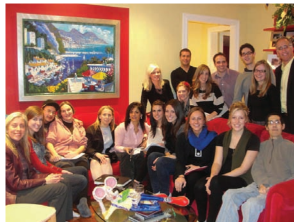
2011 TORONTO HOO COMMITTEE