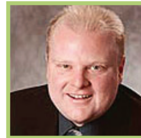
DALTON MCGUINITY, PREMIER

Please accept my best wishes for an enjoyable evening and a successful fundraiser.