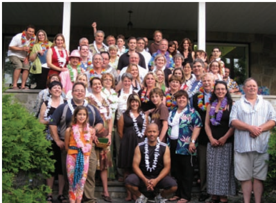
DELEGATES FROM ACROSS CANADA AT THE ANNUAL BIAC CONFERENCE, IN MONTREAL IN 2009. LAST YEAR'S CONFERENCE WAS HELD IN REGINA.

A national conference fully funded by BIAC. It brings together survivors, families and leaders to plan programs and services for the year. This year, the 7th Annual BIAC National Conference will be held from August 24-26, 2011 at the University of Prince Edward Island in Charlottetown, Prince Edward Island. Everyone is welcome. To register, please visit www.biac-aclc.ca