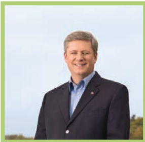
THE RT. HON. DAVID JOHNSTON, THE GOVERNOR GENERAL

I would like to express my gratitude to the volunteers, members and supporters of the Brain Injury Association of Canada and to wish you all a very successful event.